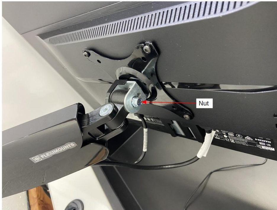
Figure 2: Adjustment Nut location