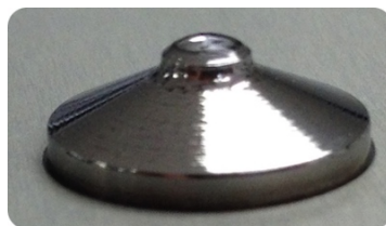
Figure 2a: Unconditioned surface.