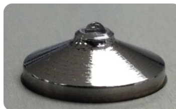
Figure 2b: Conditioned surface.